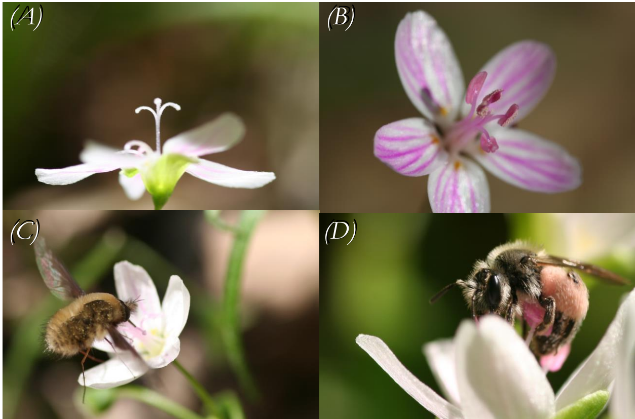
FIGURE 1. Photos of the Claytonia virginica pollination system. (A) A C. virginica female-phase flower. (B) A C. virginica male-phase flower. (C) The bee-fly Bombylius major visiting C. virginica . (D) The oligolectic bee Andrena erigeniae visiting C. virginica .

During each five-minute observation period, volunteers observed their focal flowers. When an insect visited, volunteers recorded the identity of that visitor to the best of their ability and recorded the number of male- and female-phase visits that visitor made. Volunteers counted the number of total visits regardless of whether they were made by the same pollinator individual or different individuals. When identifying insects, we encouraged volunteers to use the functional groups that we provided; however, if the volunteer was not sure of the identification, the volunteer identified the insect as “unknown”.